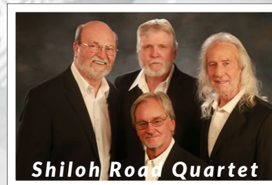
Shiloh Road Quartet